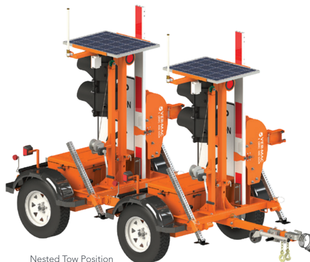
Nested Tow Position